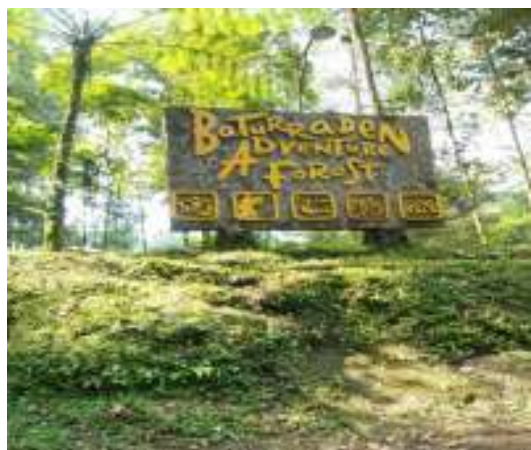
Figure 3. Baturraden Adventure Forest (BAF)

The available facilities consist of 8 categories: outbound training, student outbound, riverside camp, family camp, canyoning package, water slider, paintball war, and walk-in program. In addition to the various programs offered, BAF cooperates with the State Forestry Company with a contract system for forty years.