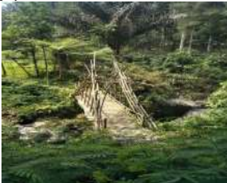
Figure 6. Baturraden Adventure Forest (BAF) Route