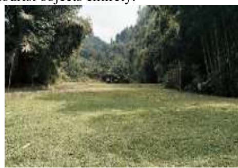
Figure 5. Places to Play