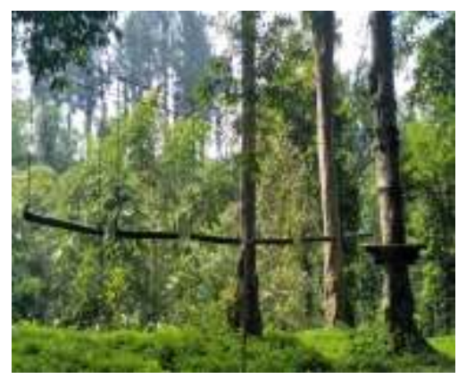
Figure 4. Student Outbound Facilities

Baturraden Adventure Forest (BAF) has twenty-seven employees working in the field area and the restaurant. Baturraden Adventure Forest (BAF) is 50 hectares with various game stations. The game stations consist of physical adventures and mind adventures. These kinds of adventures are contained in various activities such as Mountain Adventure, Water Adventure, Tree Adventure, and Eco-Adventure.